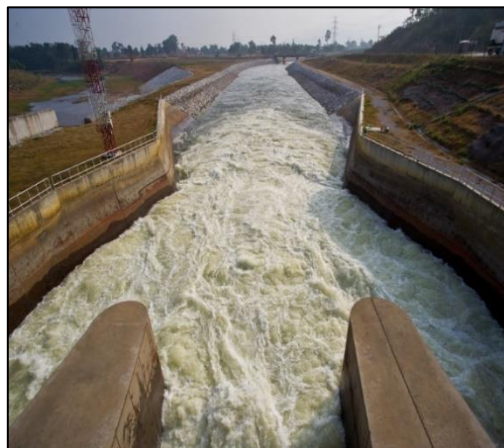
Figure 5.7: Erosion protection at Nam Theun 2, Lao People's Democratic Republic

Increased sediment load in the river can extend a long way downstream and can smother aquatic vegetation and habitats. This can be particularly problematic where gravel beds provide important habitat for downstream fisheries. More turbid water can also encourage fish to move to cleaner parts of the river. If sediment levels are very high, this can result in the smothering of aquatic invertebrates and can coat the gills of the fish causing death. Where significant erosion risks are likely, protection measures will be required (Figure 5.7).