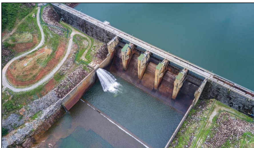
Figure 5.5: Dam at Nam Theun 2, Lao People's Democratic Republic, with downstream flow provision.

Changes to a river's hydrological regime can negatively impact its aquatic ecosystem and can disrupt important ecological processes. The health and integrity of a river system will usually depend on a range of high, medium, and low flows. Most rivers experience natural annual low flows which reduce connectivity and limit species migration. This may be positive for native species which can often out-compete invasive species that have not adapted to low flows. So, maintaining low flows at their natural timing and level can maintain the abundance and survival rate of native species (Figure 5.5). Medium or base level flows will usually occur during most of the year. These flows maintain the hydro-geomorphology of a river which, in turn, maintains habitat, temperature, and dissolved oxygen levels to support aquatic species. Short high flow events are also important to prevent vegetation from encroaching on river channels and to move sediment and organic matter downstream. High flows can also reduce water temperature and increase dissolved oxygen, which can trigger ecological processes such as spawning and migration. Consequently, river flows altered by a hydropower project can lead to a reduction in health and integrity of the river system 19 .